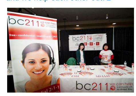
An event promoting BC211's services.

BC211 strives to be a great place to work. We have employee-driven teams such as the Green Team, who helped us obtain our Climate Smart designation. We also have a Wellness Team and when we were relocating to our new home at the Woodward's building, we had a Moving Team who was involved in all aspects of the relocation. We recently completed a wellness survey and a leadership survey to assess how employees are feeling about workplace wellness and the effectiveness of the leadership team. All staff receive one coaching session a month and those answering the phone also have clinical supervision and a debriefing with a Team Lead or Manager when necessary. We're a close knit group and we help each other out.