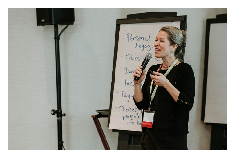
The three days of workshops allowed for critical thinking, brainstorming new ideas and gaining tools to take back to the workplace.