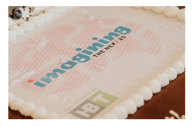
We couldn't have a 25 year celebration without cake! The delectable tuxedo cake emblazoned with our logo was a standout.