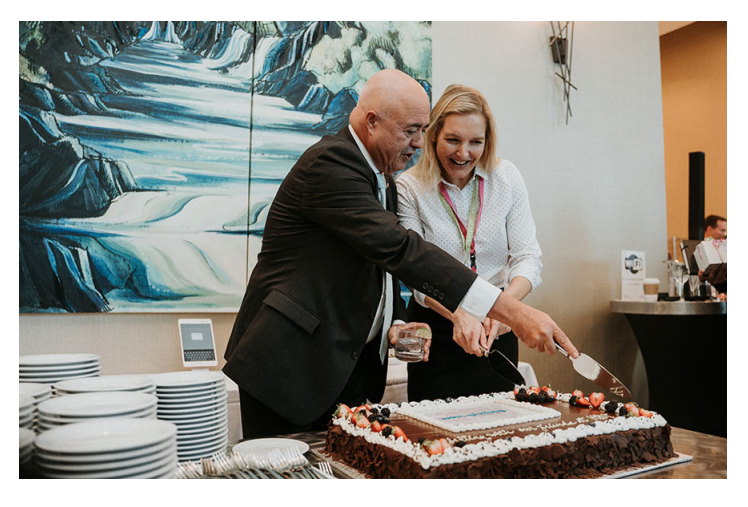
With the generous support of HBT, we organized an energetic and well-attended reception to celebrate our 25th year anniversary.